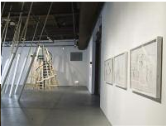
Installation at Real Art Ways of "A Thought at the Edge of the Continent: Manchuria to Siberia 1942 – 1947" by Hirokazu Fukawa.

In addition, a presentation grant was awarded to 2008 Creation of New Work grantee Real Art Ways to present Hirokazu Fukawa's completed work, "A Thought at the Edge of the Continent: Manchuria to Siberia 1942 – 1947," on view in early 2009.